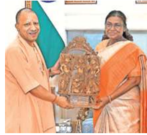
CM Yogi Adityanath with President Droupadi Murmu at Rashtrapati Bhavan in New Delhi on Wednesday. In a post on X, the President stated, "CM of UP Yogi Adityanath called on President Droupadi Murmu at Rashtrapati Bhavan."

The government stated that Chief Minister Yogi Adityanath has personally urged the Centre to take these issues seriously and offer appropriate support. Reflecting the rising scale and frequency of these disasters, the state has proposed increasing the