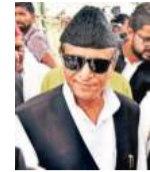
Former MP Mohammad Azam Khan

According to the petitioners' counsel, the trial court had last year consolidated 12 separate FIRs, filed at Kotwali police station in Rampur, into a single trial. These FIRs relate to an alleged forcible demolition of unauthorised structures at the Yateem Khana premises on October 15, 2016.