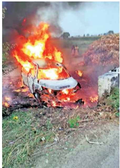
The car up in flames after it crashed.