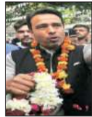
RJD president Jayant Chaudhary.

Speaking to reporters at an event in Khehra, Baghpat, Chaudhary said, "People re-elected Yogi Adityanath because he prioritised law and order. The chief minister is serious and sensitive about it. If you put Akhilesh